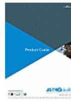
Weather & Acoustic Seals